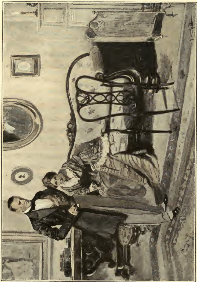
Doctor John rose from his chair and slowly paced the room.